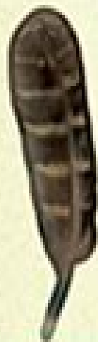
Western Screech Owl (Dorsal)

This collection contains 8 North American owl feather replicas. Carefully remove the feathers from the templates and store both in the bag (provided). To keep their natural appearance, the feathers are not labeled. If you need to confirm their identity, simply fit them in the corresponding template. Each feather has a unique shape and both the dorsal and ventral side of the templates are labeled. The feathers are printed on waterproof paper and can be washed in warm soapy water.