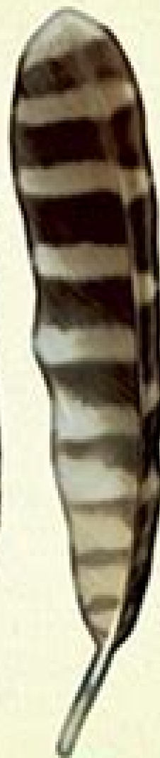
Barred Owl (Dorsal)