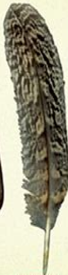
Great Horned Owl (Dorsal)