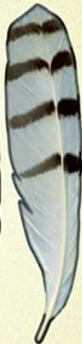
Snowy Owl (Dorsal)