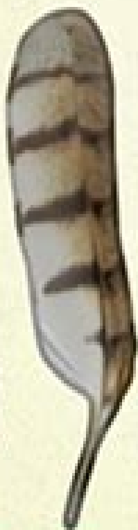
Barn Owl (Dorsal)