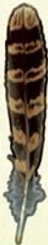
Short Eared Owl (Dorsal)