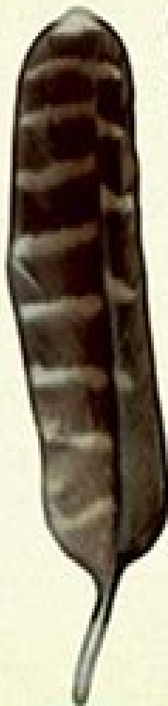
Screech Owl, Tail (Dorsal)