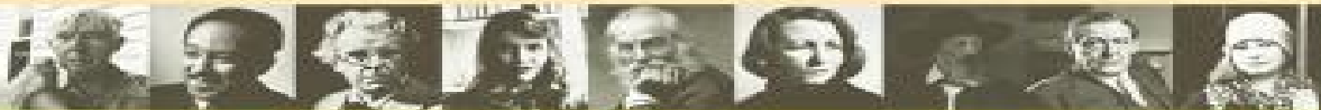
Frost Hughes Keats Plath Whitman Miller Morrison Eliot Auden

Read Great Poets Read Great Works from the American Plan