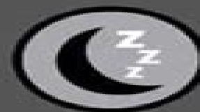
Changes in body sensations, sleep and appetite