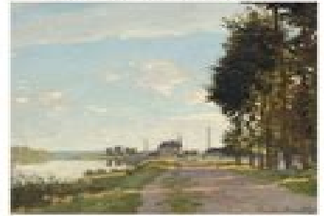
"Argenteuil, 1872" The National Gallery of Art