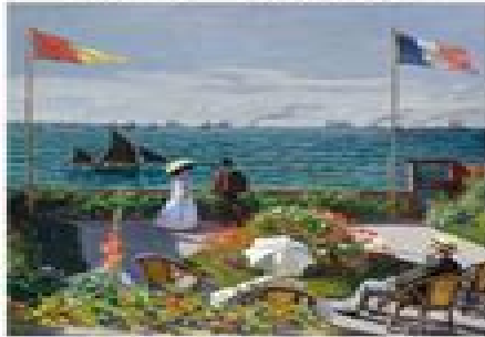
"Garden at Sainte, 1867" The MET Museum