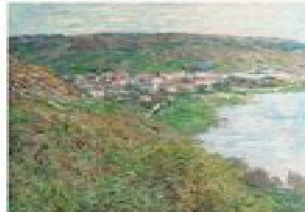
"View of Vétheuil, 1880" The Los Angeles County Museum of Art