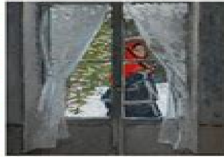
"The Red Kerchief, 1868 - 1873" The Cleveland Museum of Art