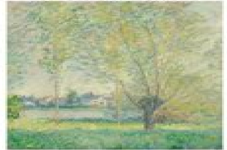
"The Willows, 1880" The National Gallery of Art