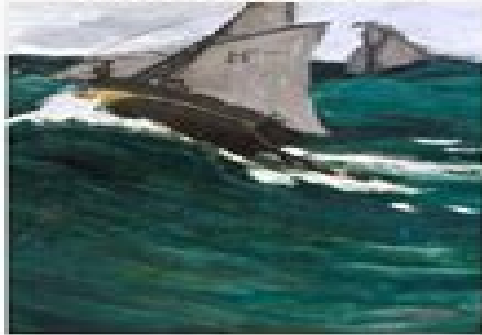
"The Green Wave, 1866 - 1867" The MET Museum