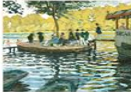
"La Grenouillère, 1869" The MET Museum