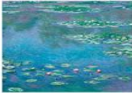
"Water Lilies, 1906" The Art Institute of Chicago