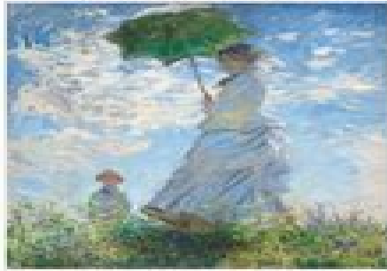
"Woman With a Parasol, 1875" The National Gallery of Art