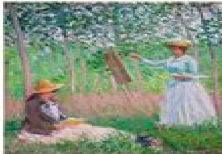
"In The Woods at Giverny, 1887" The Los Angeles County Museum of Art