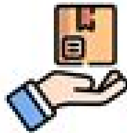
1.0 : PRODUCT-CENTRIC MARKETING