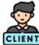
2.0: CUSTOMER- CENTRIC MARKETING