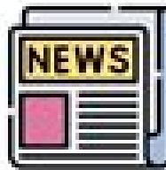
4.0: FROM TRADITIONAL TO DIGITAL MARKETING