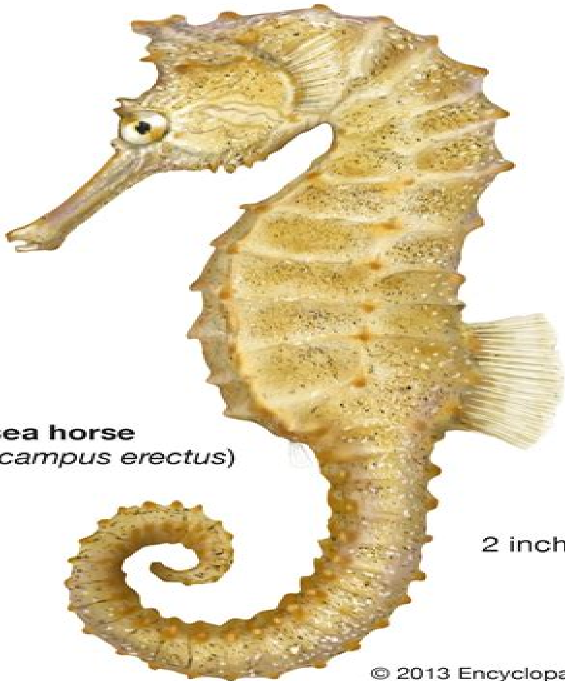
lined sea horse (Hippocampus erectus)